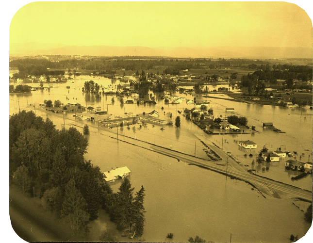
1964 Flooding near E. Cottonwood, Evergreen, MT