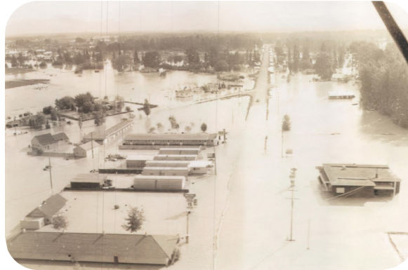
1964 Flooding Strip in Evergreen, MT

Flathead County floodplain management is a coordinated effort between: the Flathead County Planning and Zoning Office, Flathead Conservation District (FCD), US Army Corps of Engineers (USACE), Montana Department of Environmental Quality (MDEQ), and Department of National Resource and Conservation (DNRC).