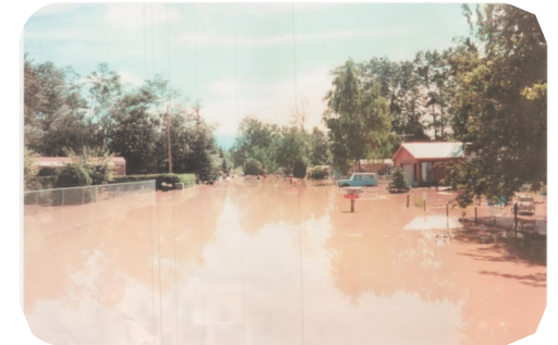
1995 Flooding near E. Evergreen Dr., Evergreen, MT

**Important to Note: The floodplain permit application will only be considered complete once ALL other required permits are obtained from applicable agencies. This includes the 310 Permit, 318 Permit, 404 Permit, or 124 Permit. Applications should be submitted to each agency at the same time for the process to run smoothly.