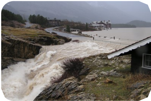
2006 Flooding near Many Glacier, Glacier National Park, MT

The permit process requires all projects to be reviewed in accordance with Flathead County's Floodplain and Floodway Management Regulations. This aids in mitigating potential impacts on adjacent property owners, river systems, and floodplains.