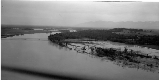
Sportsman's Bridge—June, 1964

Some of Flathead County's greatest natural attractions are its multiple river systems. The Flathead, Stillwater, Swan and Whitefish Rivers have all experienced flooding events in the past and will do so again in the future. There are also multiple smaller creeks, including Ashley, Trumbull, Bear, and Spring Creek, that can produce flooding. Major high water events have occurred in 1948, 1974, 1975, 1995, and 1997. The flood of record in Flathead County occurred in 1964.