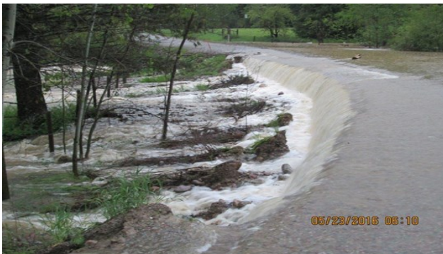
Rabb Road flooding May, 2016

While the 100-year floodplain means there is a 1% annual chance of flooding, high water and flood damage can occur at any time.