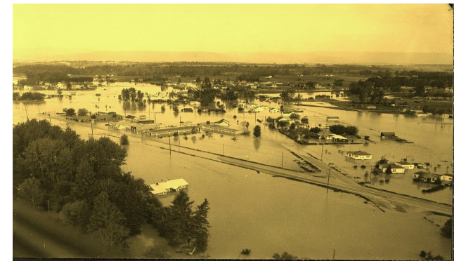
East Cottonwood Drive, Kalispell MT, 1964