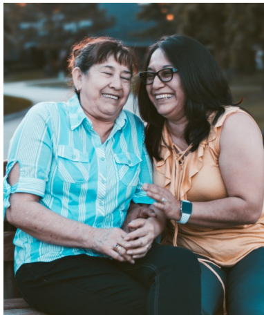
Caregiver Health & Early Stage Programs