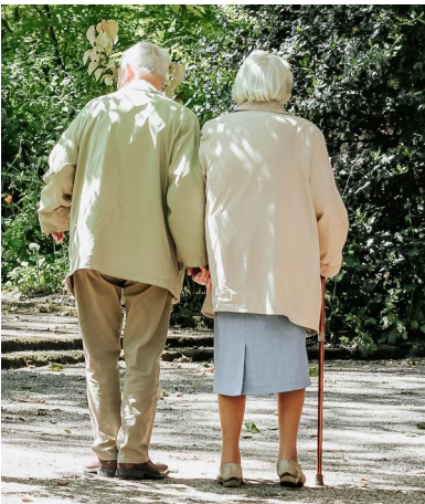
Understanding Dementia Behaviors

Open to Anyone, including Community Members, Service Providers, First-Responders, Family & Professional Caregivers